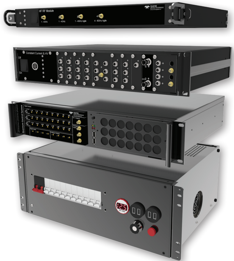
Mixed Signal Controller Modular System

Power for coils, ion pumps and other DC loads are supplied from a battery module, and interfacing for a large number of thermocouples is also supported.